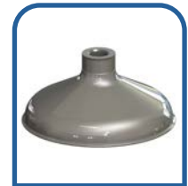
STAINLESS SHOWER ROSE