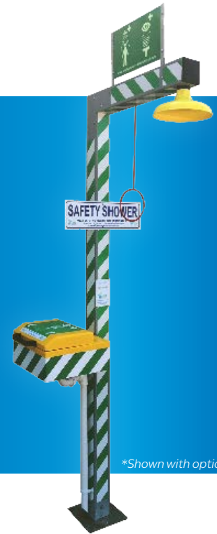
*Shown with optional eyebath