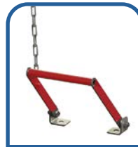
EYEBATH FOOT TREADLE