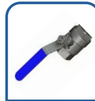
MANUAL DRAIN VALVE