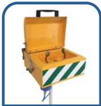
EYEBATH (fitted internal or external)