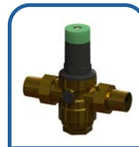
PRESSURE REGULATING VALVE