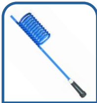
FLEXIBLE FACE/BODY WASH