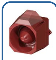
FLASHING ALARM & SIREN