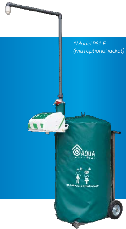
*Model PS1-E (with optional jacket)