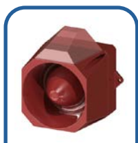
FLASHING ALARM & SIREN