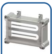
LOW ENERGY LIGHTING