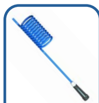
FLEXIBLE FACE/ BODY WASH