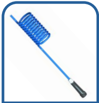
FLEXIBLE FACE/BODY WASH