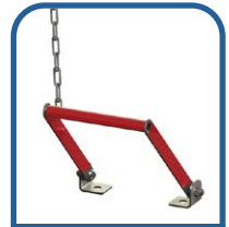
EYEBATH FOOT TREADLE