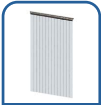
HEAVY DUTY STRIP CURTAIN