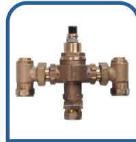
THERMOSTATIC MIXING VALVE